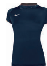
141 Navy / Navy