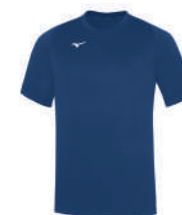
141 Navy / Navy