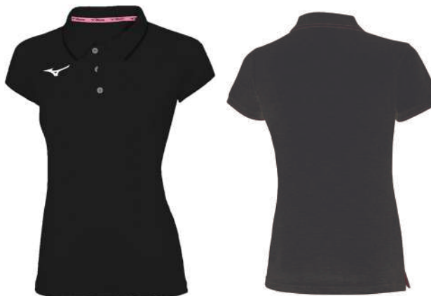
191 Black / Black