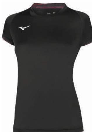
191 Black / Black