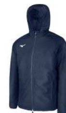
14 Navy / White