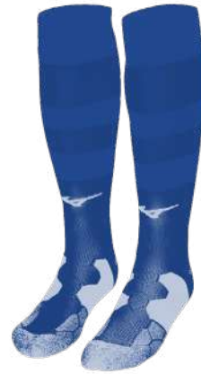
28 Royal Blue