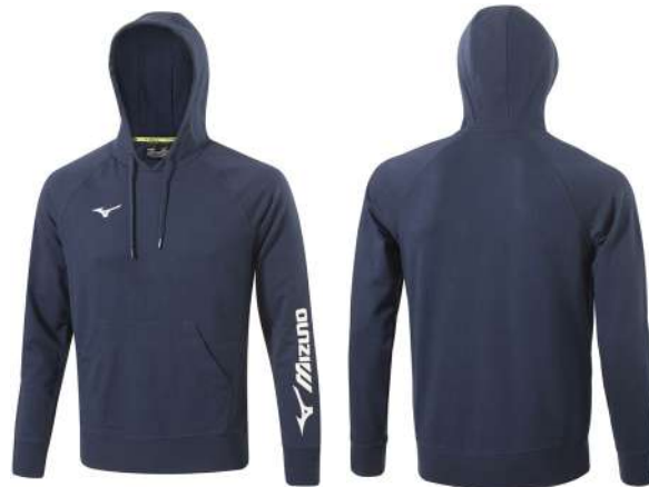
14 Navy / White