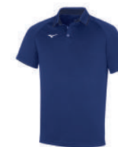
141 Navy / Navy