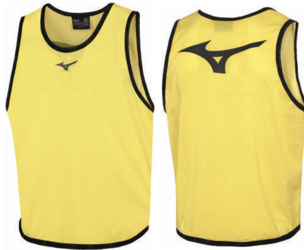
44 Yellow Fluo