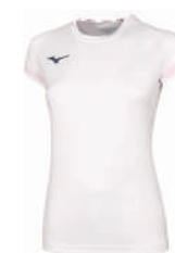
101 White / White