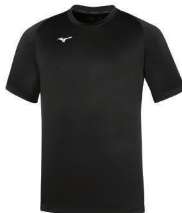
191 Black / Black