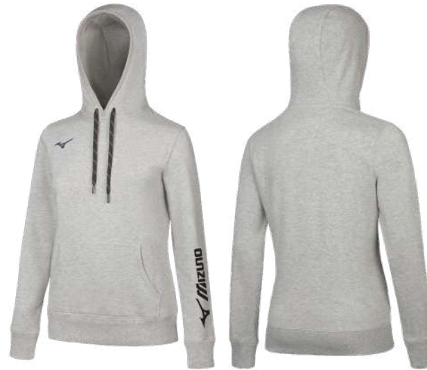
07 Grey Melange