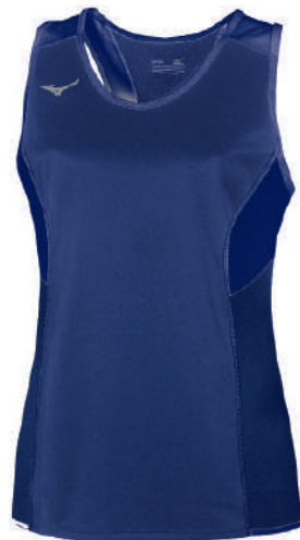
141 Navy / Navy