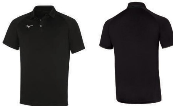
191 Black / Black