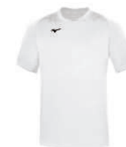
101 White / White