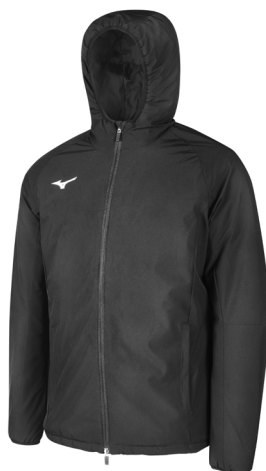
09 Black / White