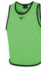
09 Green Fluo