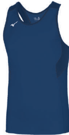
141 Navy / Navy