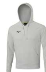
07 Grey Melange