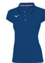
141 Navy / Navy